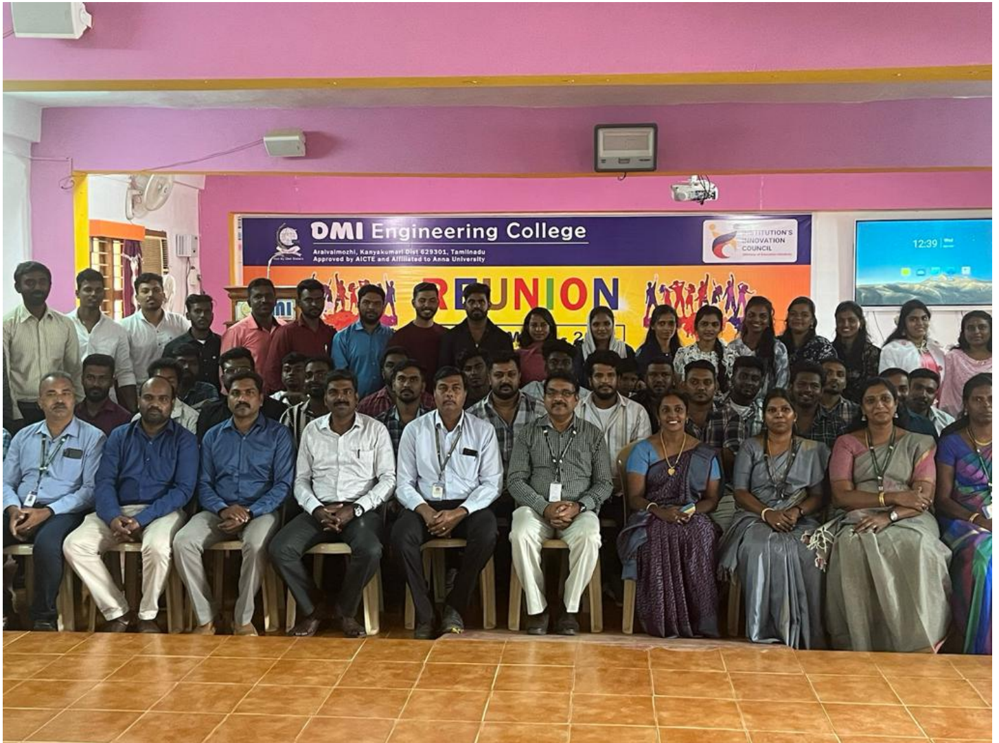
Alumni of DMIEC along with the Staff members on 27th December 23

"Reunions are not just gatherings; they are echoes of shared moments, chapters revisited, and the unwavering spirit of an alma mater echoing through the laughter and stories of its alumni."